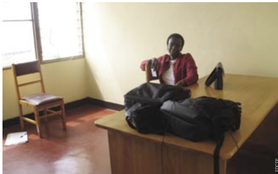
Resource poor: This sparsely furnished room is Rwanda's national ethics office and sees about three clinical trial protocols each month.

Finding the money is only the first hurdle. TB trials face a myriad of scientific problems that need urgent solutions—such as, for example, how to tell whether a drug has successfully cured the disease.